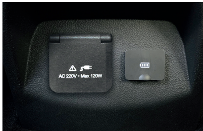
220V POWER OUTLET.

The ACC automatically adjusts the vehicle speed to maintain a safe following distance.