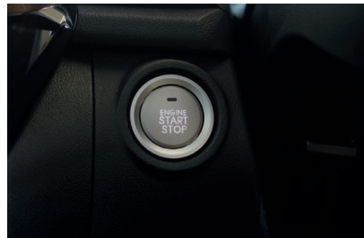
SMART KEYLESS ENTRY AND A PUSH START BUTTON.