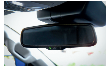
AUTO-DIMMING MIRROR & DASHCAM POWER OUTLET.