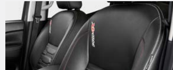
BLACK LEATHER (PRO-4X)