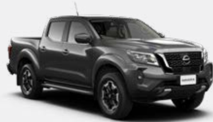
Techno Grey (M) - KY5