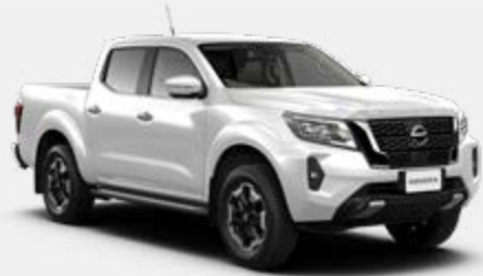
White (S) - QM1