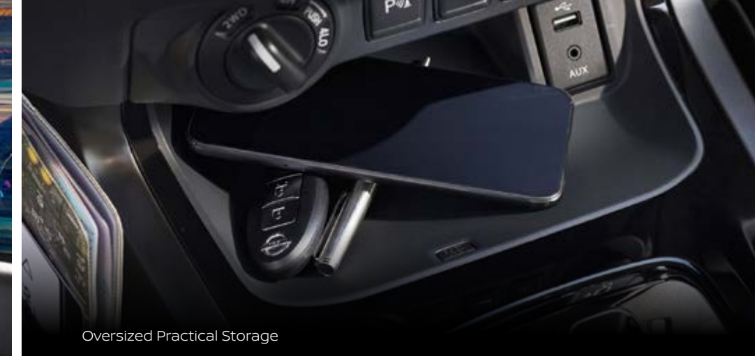
Oversized Practical Storage

Form meets function as you discover how the Navara cabin has been thoughtfully planned out to seamlessly integrate into every moment; be it for work, play or leisure. Generous storage areas, sunglass stowing, an oversized glove box and multiple charging points make the all-New Navara the perfect companion for everyday life.