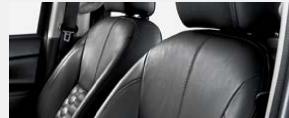
BLACK LEATHER (LE Grade)