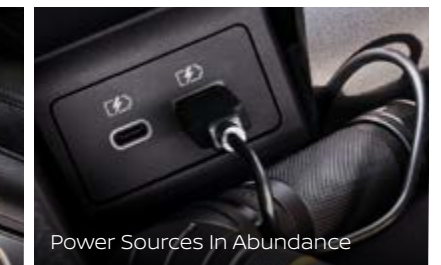
Power Sources In Abundance