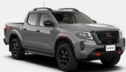
Warrior Grey (PM) - KBY Available on PRO-2X and PRO-4X only