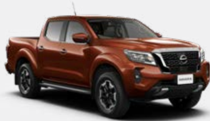
Forged Copper (M) - CAU