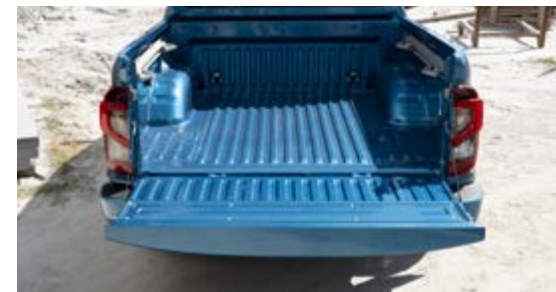
LOAD BOX FLOOR DEPTH

Special focus has been placed on towing and payload, so the new Navara features a stronger rear axle to allow for heavier loads with even more confidence. To accommodate the more powerful engine plus greater towing and payload capabilities, the rear brake size has been increased to reduce fade and provide more balanced stopping power.