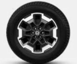
18" ALLOY (LE Grade)