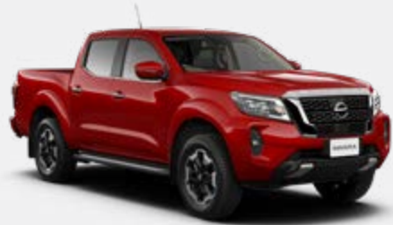
Red (S) - AX6