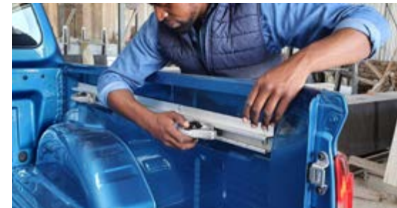
UTILI-TRACK CHANNEL SYSTEM

Gone are the days where a choice has to be made between hardworking and good looking. The all-new Navara boasts extensive range model depth, catering for every driver need and requirement, with several model and grade options across the board. The LE Model offers exceptional levels of bold and dynamic styling, with generous levels of premium interior comfort, safety and connectivity technology; without compromising on tough hardworking credentials to tackle the harshest African conditions.