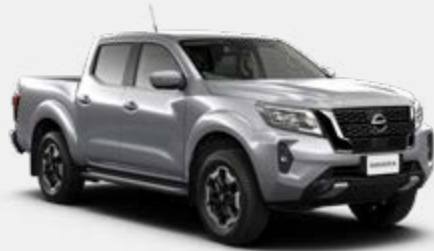
Silver (M) - KYO