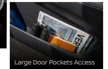
Large Door Pockets Access