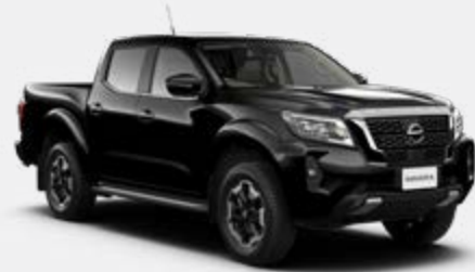
Infinite Black (S) - KH3