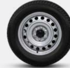
16" STEEL (SINGLE CAB)