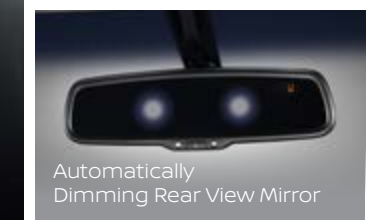
Automatically Dimming Rear View Mirror