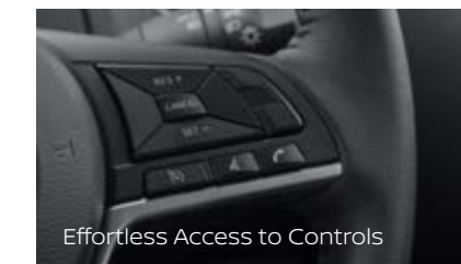
Effortless Access to Controls

Navara maximises storage inside and out. The rear seats feature secure under-seat storage and boast the ability to remain conveniently flipped up to help transport taller items.