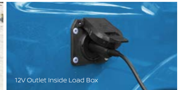
12V Outlet Inside Load Box