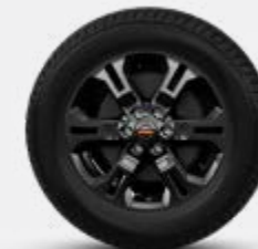
17" ALLOY (PRO-2X and PRO-4X)

Nissan's commitment to quality: To provide all customers with a consistently high level of quality, Nissan applies the same standards worldwide, to ensure that all Nissan owners enjoy peace of mind for the lives of their vehicles. The approach is based on quality from the customer's perspective on three key elements: First, the expectation of a smooth driving experience with complete peace of mind. Second, the intangible appeal of a vehicle, its power to captivate and excite, with features that capture attention and imagination. Third, the level of attentiveness and service during the sales process, and long after the sale is concluded.