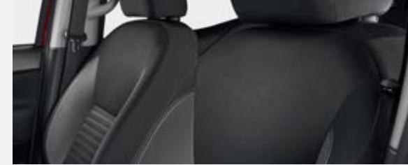
CLOTH (SE and SE Plus Grades)