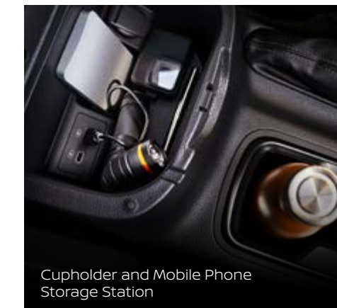
Cupholder and Mobile Phone Storage Station