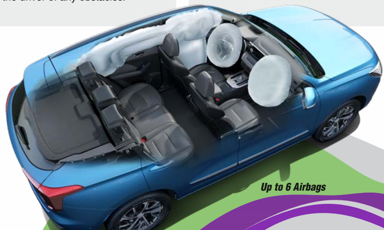
Up to 6 Airbags

The Adaptive Cruise Control (ACC) automatically adjusts the vehicle speed to maintain a safe following distance, which also includes Autonomous Emergency Braking (AEB). This automatically avoids collisions by detecting pedestrians or bicyclists and activating the brakes automatically.