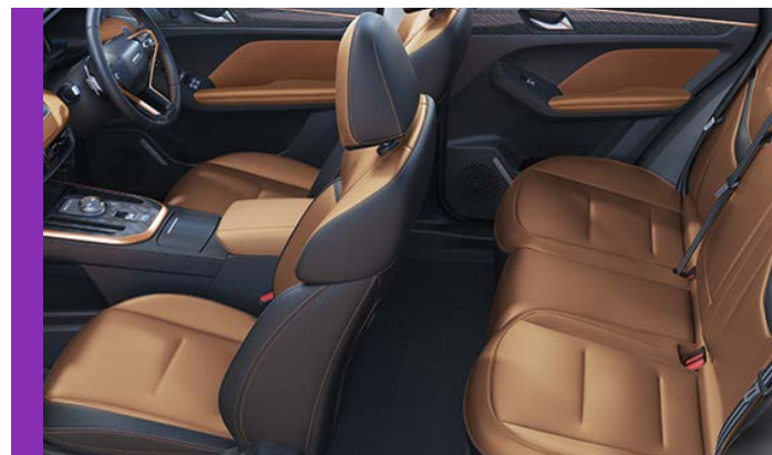
Black and Brown