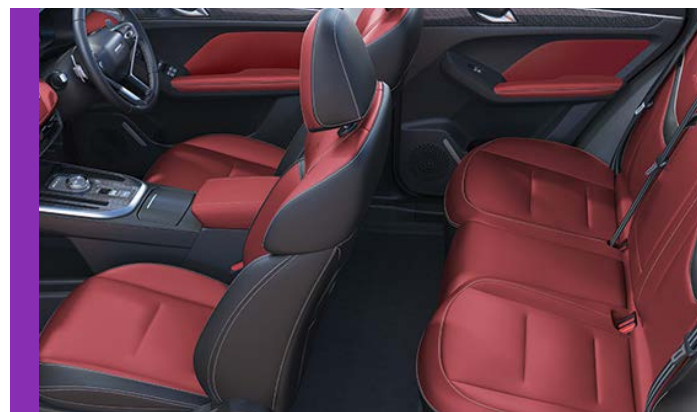
Black and Red