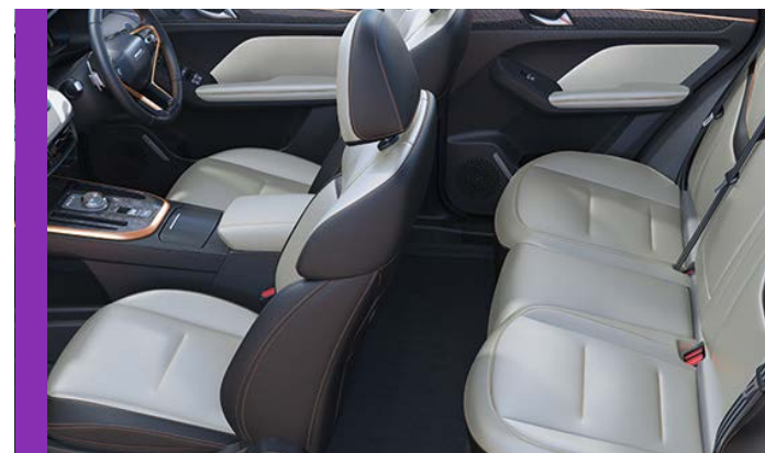
Black and Grey

* Available on selected models only Luxury and Super Luxury grades