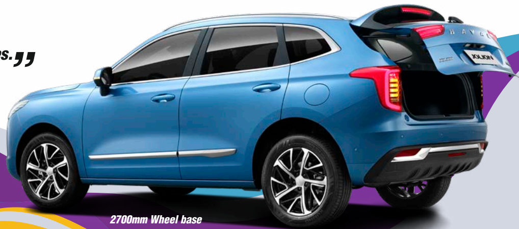
2700mm Wheel base

“Exquisite design and Flexible 26 Storage spaces.”